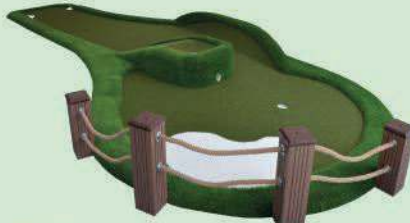
PAR: 4 8. RAMP : 790 cm * 355 cm

At the Ramp, you can putt the ball by one of the 2 alternatives; 1st alternative putt is using the dip slope. 2nd alternative putt is using ramp. But take consideration of the slope of ramp to balance your power.