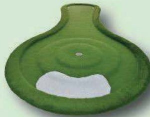
PAR: 3 2. miniVOLCANO : 515 cm * 235 cm

At the Volcano, you can putt the ball straight to the hole. But take consideration of the slope of double plateau and avoid the bunker.