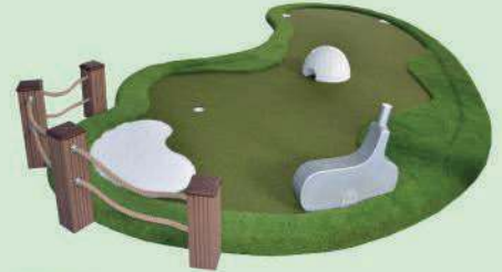
PAR: 3 3. BABY : 710 cm * 350 cm

At the Baby, you can putt the ball by one of the 3 alternatives; 1st alternative putt is using half golf ball shaped tunnel, 2nd alternative putt is using putter shaped obstacle, 3rd one is hitting the ball straight to the hole between tunnel and fairway.