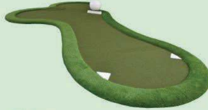
PAR: 2 11. BONE : 715 cm * 350 cm

At the Bone, you can putt the ball by one of the 2 alternatives; 1st alternative putt is hitting the ball straight to the hole directly, 2nd alternative putt is using golf ball shaped obstacle with base.