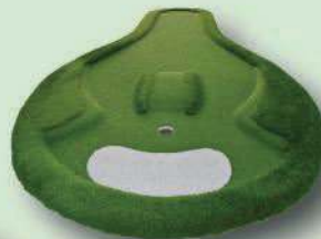
PAR: 2 5. miniRACKET : 515 cm * 225 cm

At the Racket, you can putt the ball by one of the 3 alternatives; 1st alternative putt is hitting the ball straight to the hole directly, but take consideration of the slope of bump and avoid the bunker. 2nd and 3rd alternatives are hitting the ball through to wing sides.