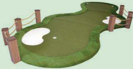
PAR: 2 7. TWIN : 760 cm * 310 cm

At the Twin, you can putt the ball straight to the hole. But take consideration of the slope of bumps and avoid the bunkers.