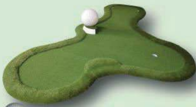
PAR: 2 10. miniBONE : 515 cm * 250 cm

At the Bone, you can putt the ball by one of the 2 alternatives; 1st alternative putt is hitting the ball straight to the hole directly, 2nd alternative putt is using golf ball shaped obstacle with base.