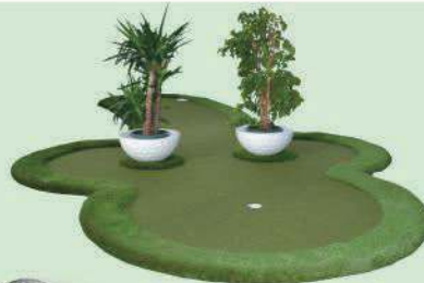
PAR: 2 17. CLOVER : 760 cm * 340 cm

At the Clover, you can putt the ball straight to the hole between golf ball shaped flower pots.