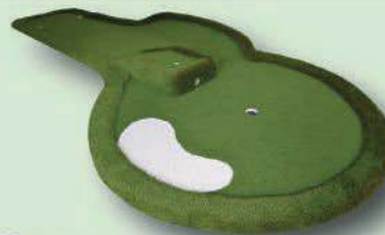
PAR: 3 11. miniRAMP : 540 cm * 235 cm

At the Ramp, you can putt the ball by one of the 2 alternatives; 1st alternative putt is using the dip slope. 2nd alternative putt is using ramp. But take consideration of the slope of ramp to balance your power.