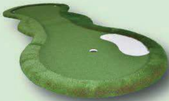
PAR: 2 1. miniBUMPY : 520 cm * 190 cm

At the Bumpy, you can putt the ball straight to the hole. But take consideration of the slope of bump and avoid the bunker.