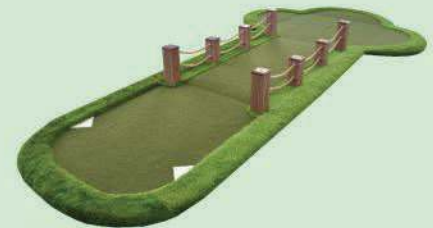
PAR: 3 18. BRIDGE : 750 cm * 350 cm

At the Bridge, you can putt the ball by one of the 2 alternatives; 1st alternative putt is hitting the ball straight to the hole directly, 2nd alternative putt is using dip slope after the hole then let your ball came back to the hole. Please take consideration of your power, balance and bump of bridge.