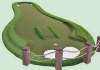
PAR: 2 5. RACKET : 705 cm * 300 cm

At the Racket, you can putt the ball by one of the 3 alternatives; 1st alternative putt is hitting the ball straight to the hole directly, but take consideration of the slope of bump and avoid the bunker. 2nd and 3rd alternatives are hitting the ball through to wing sides.