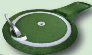
PAR: 3 4. miniCHIPPING : 515 cm * 235 cm

At the Chipping, you can putt the ball by one of the 2 alternatives; 1st alternative putt is hitting the ball straight to the hole directly, 2nd alternative putt is using club shaped obstacle with base. But take consideration of chipping ramp to balance your power.