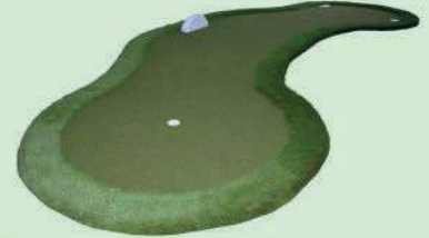
PAR: 2 12. CAR : 730 cm * 330 cm

At the Car, you can putt the ball by one of the 2 alternatives; 1st alternative putt is hitting the ball straight to the hole directly, 2nd alternative putt is using quarter golf ball shaped obstacle.