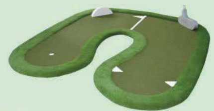
PAR: 3 9. HORSESHOE : 430 cm * 380 cm

At the Horseshoe, you can putt the ball through to the putter shaped obstacle which will direct ball to the quarter golf ball shaped obstacle to get hole in one.