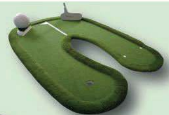
PAR: 3 12. miniHORSESHOE : 360 cm * 255 cm

At the Horseshoe, you can putt the ball through to the putter shaped obstacle which will direct ball to the quarter golf ball shaped obstacle to get hole in one.