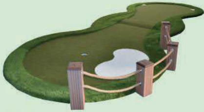
PAR: 2 1. BUMPY : 740 cm * 270 cm

At the Bumpy, you can putt the ball straight to the hole. But take consideration of the slope of bump and avoid the bunker.