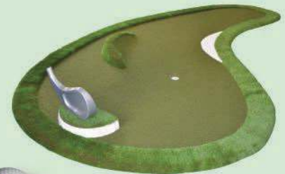
PAR: 4 15. WHALE : 600 cm * 400 cm

At the Whale, you can putt the ball by one of the 3 alternatives; 1st alternative putt is hitting the ball straight to the hole directly, 2nd alternative putt is using golf club shaped obstacle, 3rd alternative putt is using dip slope.