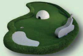
PAR: 3 3. miniBABY : 515 cm * 240 cm

At the Baby, you can putt the ball by one of the 3 alternatives; 1st alternative putt is using half golf ball shaped tunnel, 2nd alternative putt is using putter shaped obstacle, 3rd one is hitting the ball straight to the hole between tunnel and fairway.