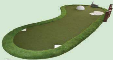
PAR: 3 10. GALAXY : 710 cm * 310 cm

At the Galaxy, you can putt the ball by one of the 2 alternatives; 1st alternative putt is hitting the ball straight to the hole directly. 2nd alternative putt is using putter shaped obstacle. But avoid the half ball shaped obstacle.