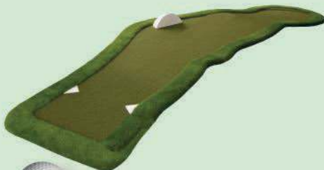
PAR: 3 16. GOLFER : 755 cm * 350 cm

At the Footprint, you can putt the ball by one of the 2 alternatives; 1st alternative putt is hitting the ball straight to the hole directly. 2nd alternative putt is using quarter golf ball shaped obstacle. But take consideration of the slope of ramp to balance your power.