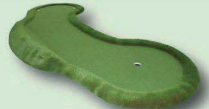
PAR: 3 9. miniCAR : 520 cm * 235 cm

At the Car, you can putt the ball by one of the 2 alternatives; 1st alternative putt is hitting the ball straight to the hole directly, 2nd alternative putt is using dip slope.