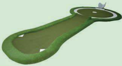
PAR: 4 4. CHIPPING : 780 cm * 350 cm

At the Chipping, you can putt the ball by one of the 2 alternatives; 1st alternative putt is hitting the ball straight to the hole directly, 2nd alternative putt is using club shaped obstacle with base. But take consideration of chipping ramp to balance your power.