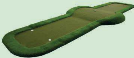
PAR: 2 13. WATCH : 720 cm * 235 cm

At the Watch, you can putt the ball straight to the hole. But take consideration of the slope of bump.