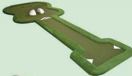
PAR: 2 14. GUITAR : 770 cm * 280 cm

At the Guitar, you can putt the ball straight to the hole. But take consideration of the slope of bump and avoid the bunker.