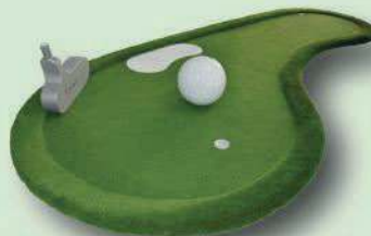
PAR: 3 8. miniGALAXY : 520 cm * 235 cm

At the Galaxy, you can putt the ball by one of the 2 alternatives; 1st alternative putt is hitting the ball straight to the hole directly. 2nd alternative putt is using putter shaped obstacle. But avoid the golf ball shaped obstacle.