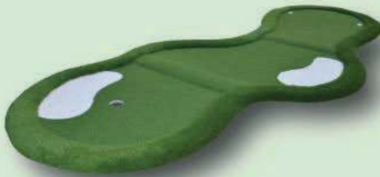
PAR: 2 7. miniTWIN : 520 cm * 235 cm

At the Twin, you can putt the ball straight to the hole. But take consideration of the slope of bumps and avoid the bunkers.