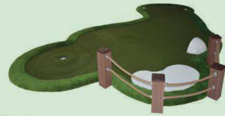
PAR: 4 6. FOOTPRINT : 710 cm * 390 cm

At the Footprint, you can putt the ball by one of the 2 alternatives; 1st alternative putt is hitting the ball straight to the hole directly, but take consideration of the slope of double plateau. 2nd alternative putt is using quarter golf ball shaped obstacle.