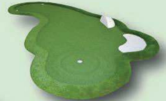
PAR: 3 6. miniFOOTPRINT : 515 cm * 275 cm

At the Footprint, you can putt the ball by one of the 2 alternatives; 1st alternative putt is hitting the ball straight to the hole directly, but take consideration of the slope of double plateau. 2nd alternative putt is using quarter golf ball shaped obstacle.