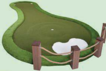
PAR: 4 2. VOLCANO : 740 cm * 330 cm

At the Volcano, you can putt the ball straight to the hole. But take consideration of the slope of double plateau and avoid the bunker.